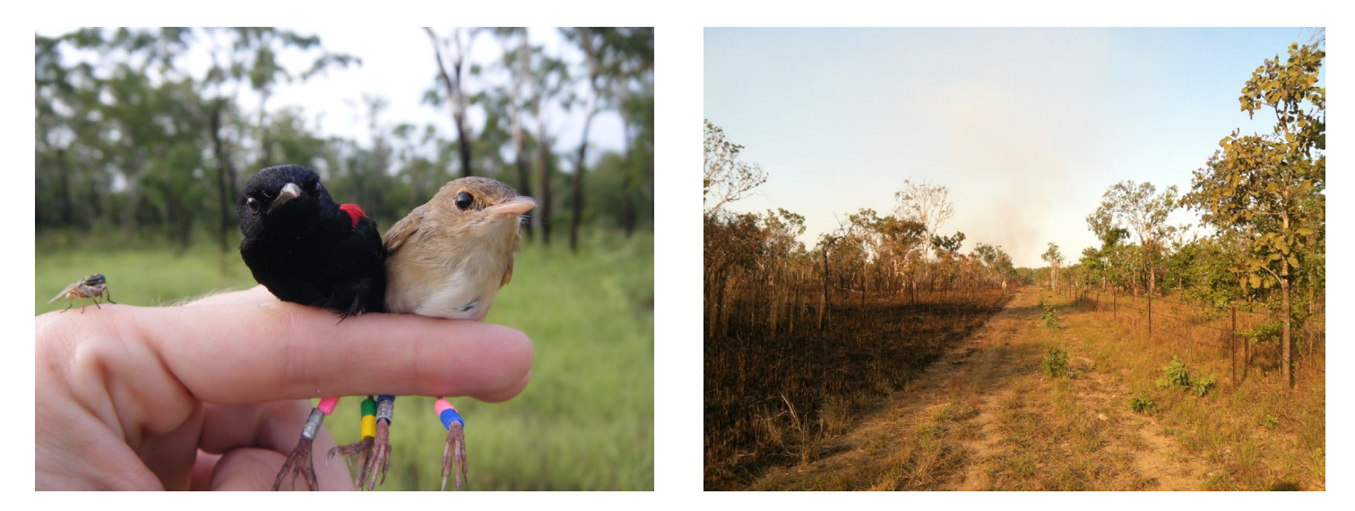
Figure 1. (A) Male (left) and female (right) RBFWs with color-bands. (B) Habitat before (right) and after (left) fire, which reduces cover necessary for foraging and security.

across their combined range. As the breeding season returns, the flock breaks up into its component parts ("fission") which return to their former territories, sometimes with a slight reshuffling of members (Griesser et al., 2009).