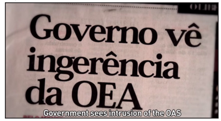
Belo Monte: An Announcement of War. Dir. Andre D'Elia. CINEDELIA, 2012. YouTube. 22:46.

This scene is followed by an info-graphic summarizing the rights guaranteed to all humans by the Universal Declaration of Human Rights (UDHR) (fig. 4 & 5). The info-graphic begins by stating, "Every man,