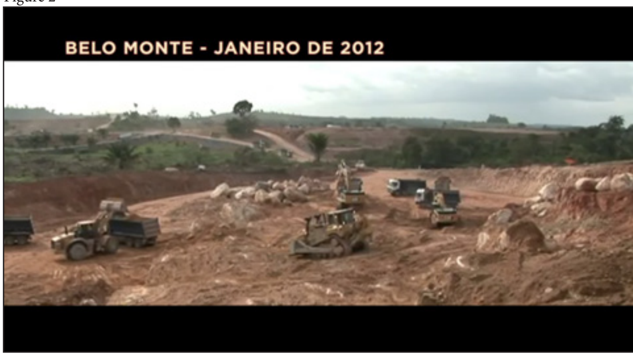
Belo Monte: An Announcement of War. Dir. Andre D'Elia. CINEDELIA, 2012. YouTube. 31:04.

In the scene above, D'Elia frames the dam as a monstrous and destructive project, encouraging audiences to protest Belo Monte. If the scene is removed from the film's context, however, it could be re-framed by developers as a narrative of economic growth and prosperity, framing the machinery and forest removal as