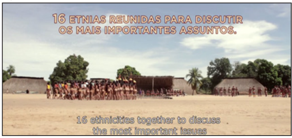
Belo Monte: An Announcement of War. Dir. Andre D'Elia. CINEDELIA, 2012. YouTube. 58:40.