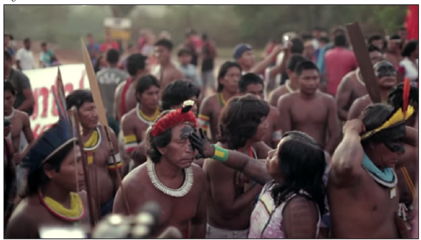
Belo Monte: An Announcement of War. Dir. Andre D'Elia. CINEDELIA, 2012. You Tube. 1:27:19.

The camera points to signs saying "private property" and "Investment of the federal government" to establish the viewer's sense of place and acknowledge the illegality of their trespassing on a government site. The scene features several linguistic aspects that connect the viewer with D'Elia and the protestors. For example,