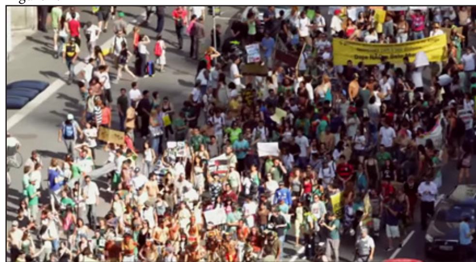
Belo Monte: An Announcement of War. Dir. Andre D'Elia. CINEDELIA, 2012. YouTube. 1:31:39.