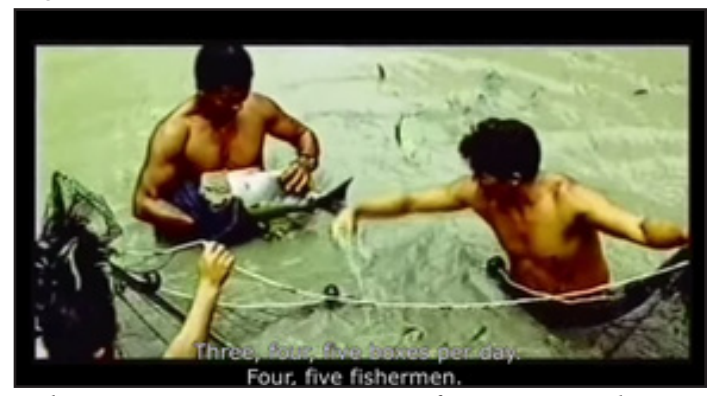
Belo Monte: An Announcement of War. Dir. Andre D'Elia. CINEDELIA, 2012. YouTube. 34:05.

These back-to-back before and after images capture the economic, social, and cultural ruin that befalls communities affected by major dam projects. These images counter the Brazilian government's insistence that these mega-projects bring prosperity and a better life to these villages, foreshadowing Altamira's fate if Belo Monte