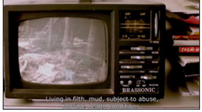
Belo Monte: An Announcement of War. Dir. Andre D'Elia. CINEDELIA, 2012. YouTube. 33:40.

these images a man's voice says, "Living in filth, mud, subject to abuse, horrible health conditions. We are suffering here" (D'Elia 33:40). Another man's voice takes over, "There is a lack of schools, sewage system and health services. There isn't anything" (D'Elia 33:51). The second man continues, telling how the residents caught many fish before the dam dried up their section of the river now, though, they are left without livelihoods. The whole village is suffering not just economically, but also in other aspects of life such as healthcare, education, and cultural loss. As he tells his story, the screen fills with older images of Tucuruí before the dam when there was a wide flowing surrounded by lush trees with fishermen leisurely pulling fish from their nets (fig. 9).