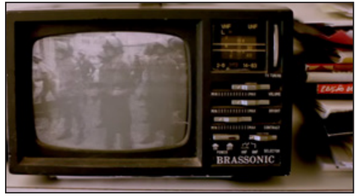
Belo Monte: An Announcement of War. Dir. Andre D'Elia. CINEDELIA, 2012. YouTube. 33:13.

From the old TV an upbeat song starts "...this is a country that goes forward..." while on the screen there are scenes of Brazil's tumultuous revolution showing excessive police and military violence (fig. 6). The music suddenly stops and images of the Tucuruí Dam pumping thousands of gallons of water appear on the small TV screen. Then the footage cuts to a woman with two small boys behind her (fig. 7). The camera is close to her face to