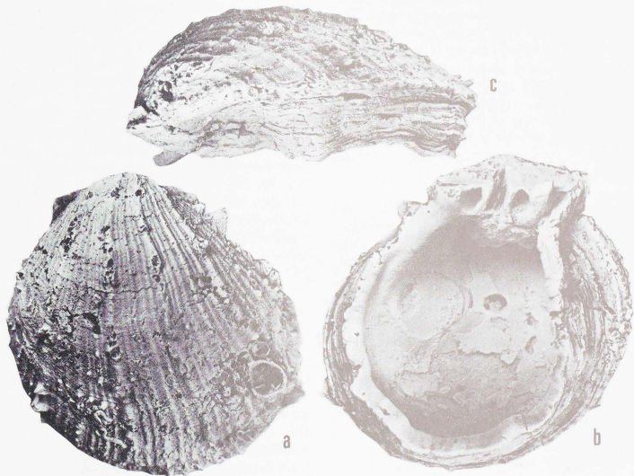
Text figure 1, Spondylus bostrychites Guppy; height 115.0 mm, width 107.3 mm, diameter 48.0 mm; locality TU 953, Moín, Costa Rica ( X \frac{1}{2} ).