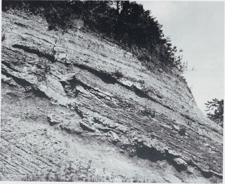
Text figure 1. View of outcrop at TU locality 1424, Puerto de los Hidalgos on west side of Mao-Los Hidalgos road, Dominican Republic.

pp. 239, 290 ("may be an Eomiltha . . . has the characteristic long, curved anterior adductor scar . . .").