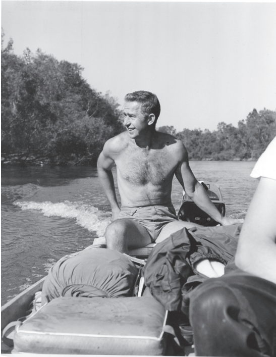
Figure 2. Suttkus surveying the Pearl River in the 1960's.

his papers deal with mammals, three deal with crayfishes, and one deals with freshwater mussels. Among his systematic and taxonomic contributions are descriptions of 35 new fish species, 29 of which are freshwater species largely confined to the southeastern United States. It is in the southeastern U.S. that his contributions to knowledge of biology have been greatest. It is hard to collect anywhere in the southeast without encountering at least one of his species. Moreover, his taxonomic treatments are among the most thorough in the profession in terms of numbers of specimens examined.